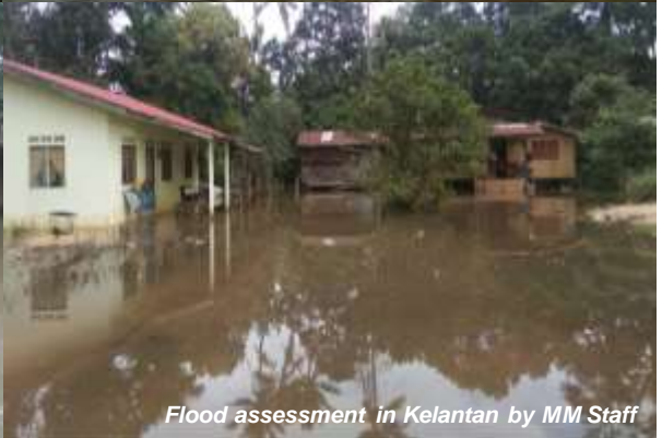
Flood assessment in Kelantan